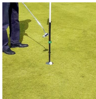
New hole appliances.

Flagsticks to remain in the hole and must not be touched , use the new appliances to remove the ball from the hole by using your putter to lift. Please do not touch the flag poles.